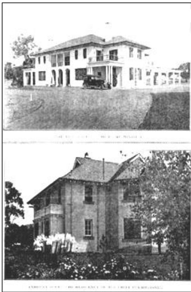
Frank Dunshea: The Commissioner's Residence [Canberra House]

Two photographs - top one is of the Prime Minister's Lodge and the bottom one of Canberra House, Acton 1927.