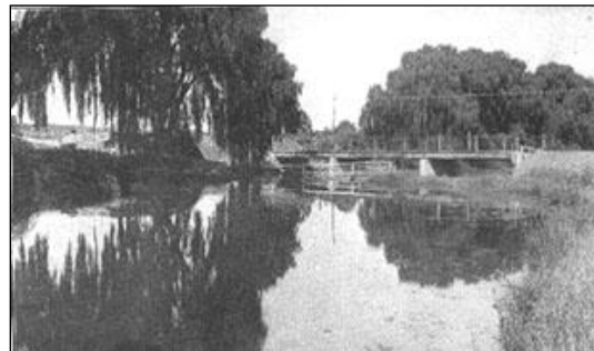
Above: Lennox Crossing in 1926