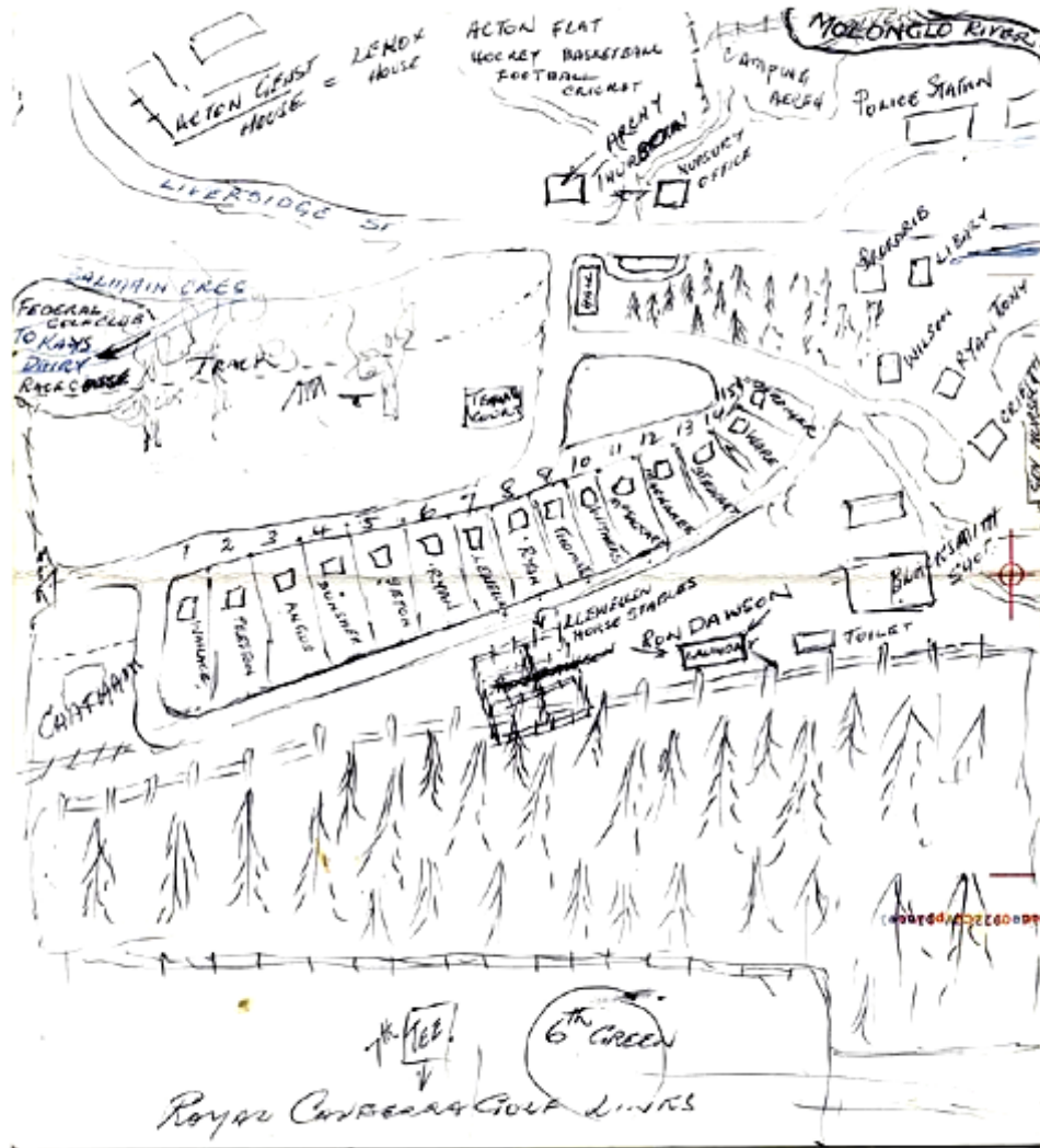
Above – mud map of Acton by a relation of Ilma Keir of Westlake