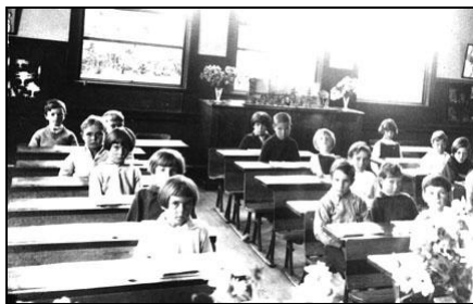
Above: Classroom at Telopea Park School, Telopea Park circa 1923.